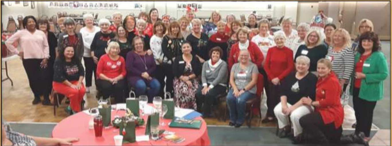
Brandon Ladies of Elks Christmas Dinner & Tree Decorating Party on December 2, 2019